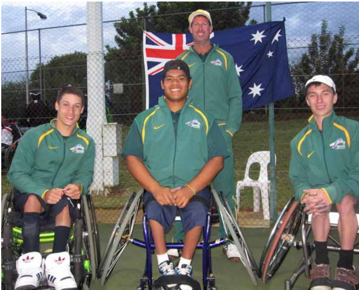
Wheelchair Tennis World Team Cup Australian Junior Team - Bronze Medallists