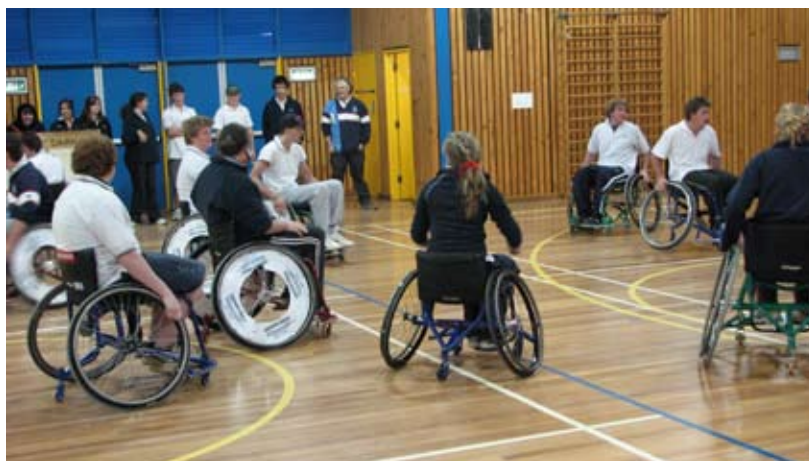
Students from Bombala High enjoying the Roadshow