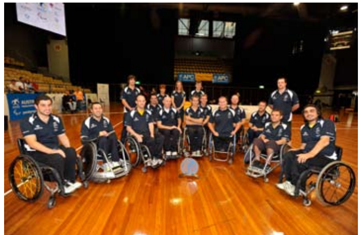
Australian Steelers Team with their winning trophy at the Closing Ceremony of the Four Nations Tournament