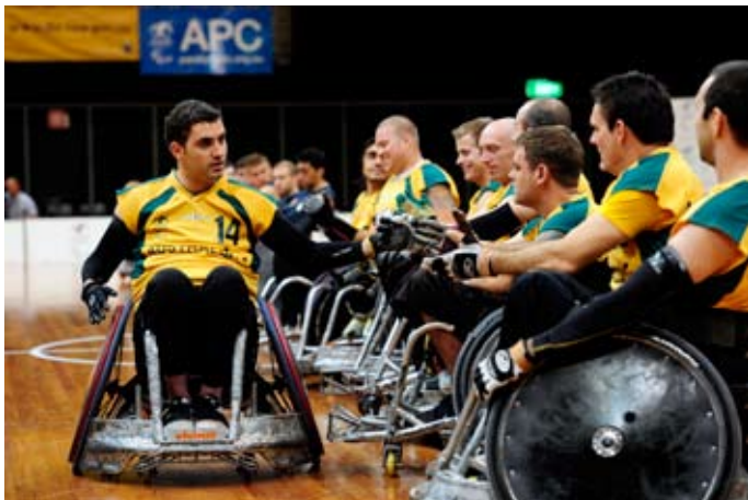
Australian Steelers Team at the Opening Ceremony of the Four Nations Tournament